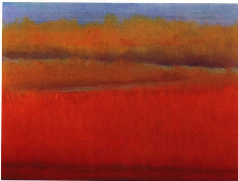
BLACKBIRD SINGS, OIL ON CANVAS, 30 X 40"