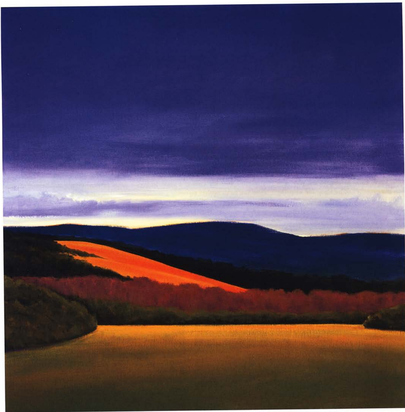
SUNDOWN MISSION RANCH, OIL ON CANVAS, 36 X 36"