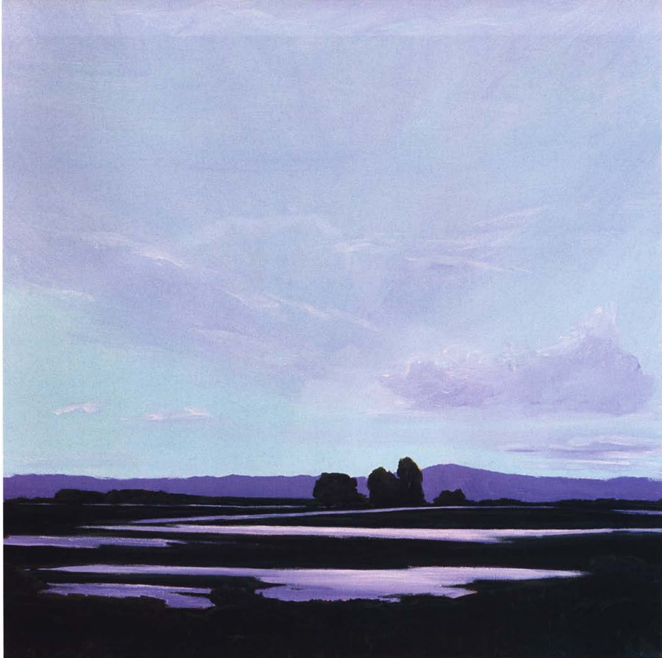
THE END OF THE RAINY SEASON, OIL ON CANVAS, 54 X 54"