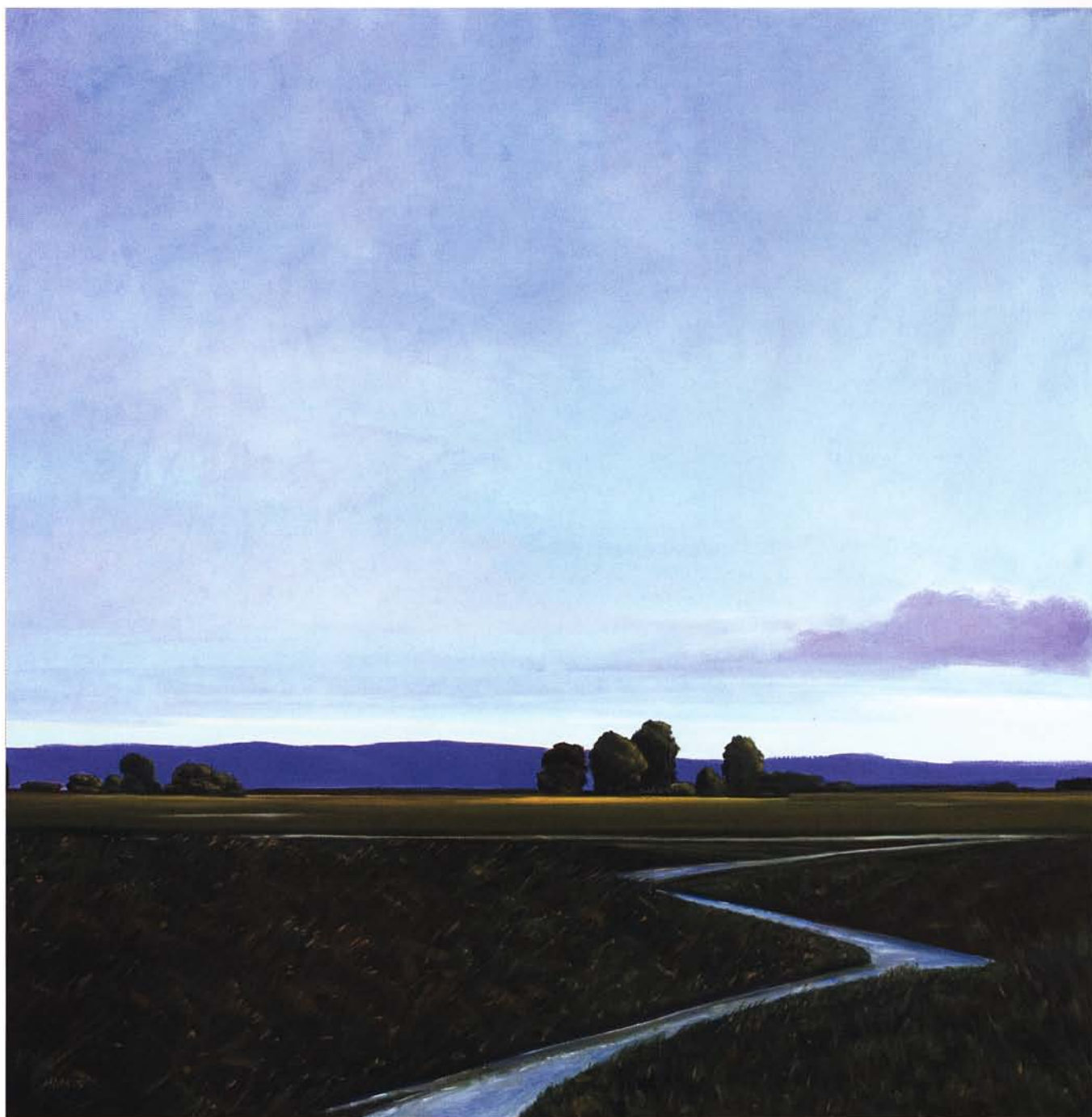
◀ HEAT OF THE NIGHT, OIL ON CANVAS, OIL ON CANVAS, 54 X 54"